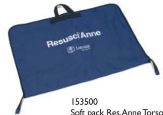
153500 Soft pack Res. Anne Torso