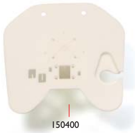
150400 Lung plate