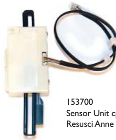
153700 Sensor Unit cpl. Resusci Anne SkillGuide